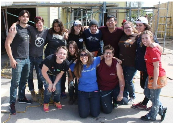
2014 Alternative Breakers from the University of Arizona

University students forego traditional spring breaks to help volunteer with Sacramento Habitat.